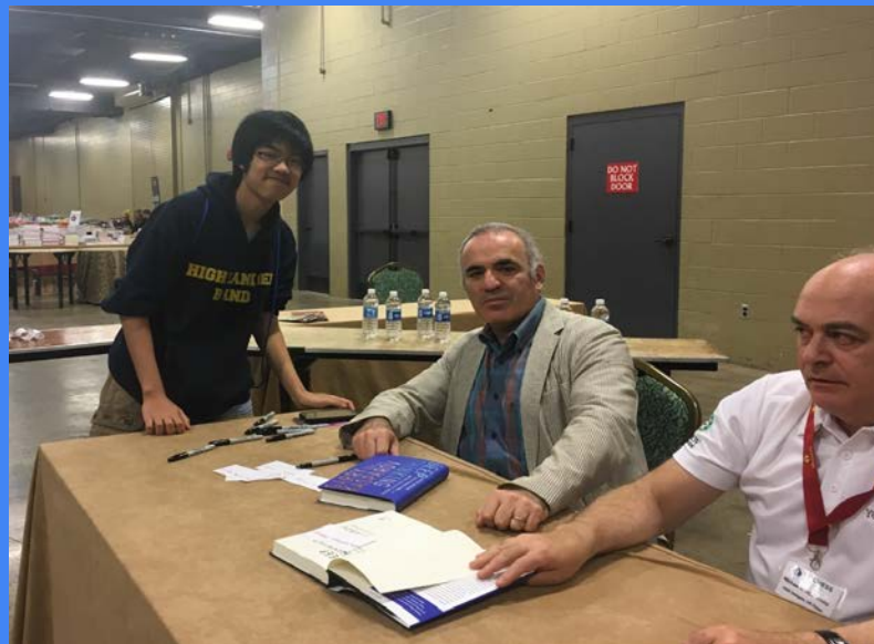
Meeting World Champion Kasparov