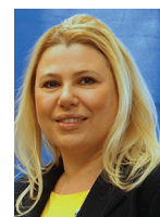
Head Coach Grandmaster Susan Polgar