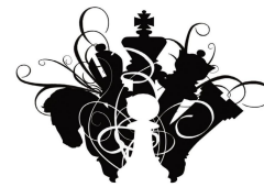
Citrus College Chess Club Chronicles