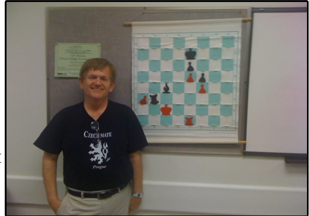
Owner and CEO of American Chess Equipment after the lecture on chess strategy.