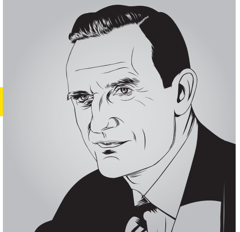
JOHN D. ROCKEFELLER III NATIONAL TOURNAMENT OF ELEMENTARY SCHOOL STATE CHAMPIONS ▶