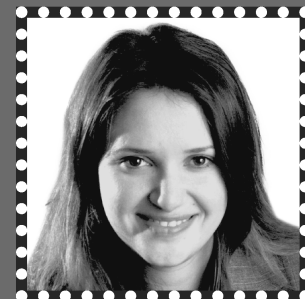
IM ANNA ZATONSKIH