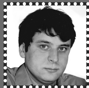
GM YURY SHULMAN